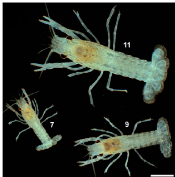
Figure 5 Variation of growth of genetically identical marbled crayfish in an aquarium: how well would epidemiologists be able to predict outcomes? 94

In model organism studies trait deviations due to developmental noise tend to be independent of one another, 104 reflecting the generally non-stable