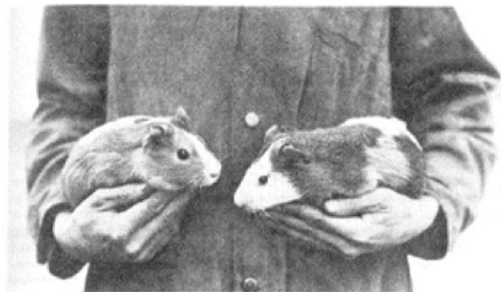
Sewall Wright holding a guinea pig in each hand circa 1920.