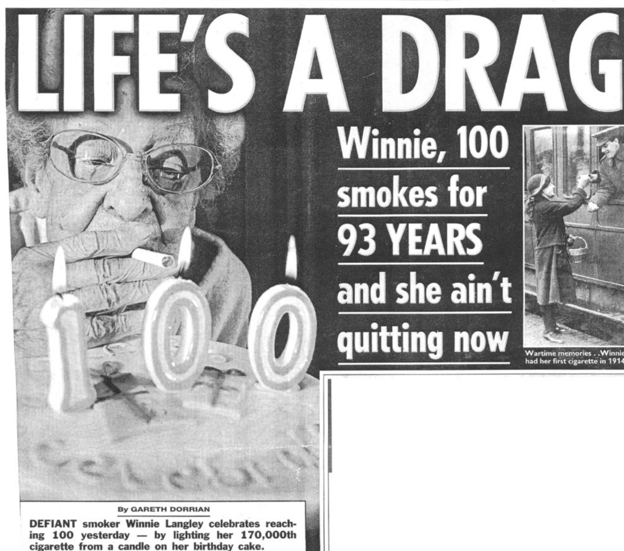
Figure 1 Winnie ain't quitting now

living, loom large in the popular imagination 2 and are reflected in the low positive predictive values and C statistics in many formal epidemiological prediction models. In general, epidemiologists do a rather poor job of predicting who is and who is not going to develop disease.