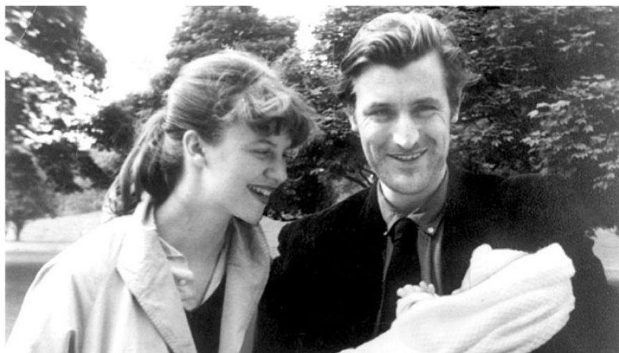
Figure 6 Sylvia Plath and Ted Hughes. In his poem about Plath's suicide, 'Last letter' Hughes wrote 'what happened that night ... is as unknown as if it never happened. What accumulation of your whole life, like effort unconscious, like birth pushing through the membrane of each slow second into the next, happened only as if it could not happen' 207

contribution of smoking to the population burden of lung cancer that <10% of variance accounted for by cigarette smoking among individuals observed in prospective epidemiological studies, and the 12% shared environmental variance reported in Table 1, should be considered. The shared environmental component will in part reflect shared environmental differences in cigarette smoking initiation. 144 The non-shared environmental component (62% of the variance in Table 1) will include the non-shared environmental influence on initiation, amount and persistence of smoking. 144 However, as discussed earlier, stable aspects of the non-shared environment—which smoking would tend to be—are generally small contributors to the total non-shared environmental effect, and thus much of this will also reflect the substantial contribution of the kinds of chance events—from the sub-cellular to the biographical—discussed above. Richard Doll, reflecting on the 50th anniversary of the publication of his classic paper with Peter Armitage on the multi-stage theory of carcinogenesis 145 considered that