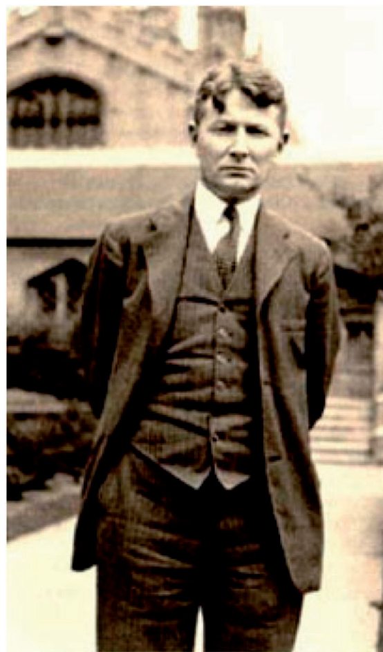
Figure 2 Sewall Wright (1889–1988). Source: Sewall Wright and Evolutionary Biology 154

The pioneering psychiatrist Henry Maudsley was present at a meeting of the newly founded Sociological Society in April 1904 when Sir Francis Galton talked on 'Eugenics: its definition, scope and aims', 184 and considered how siblings 'born of the same parents and brought up in the same surroundings' could become so different. He concluded that in his opinion 'we shall have to go far deeper down than we have been able to go by any present means of observation—to the germ-composing corpuscles, atoms, electrons, or whatever else there may be; and we shall find these subjected to subtle and most potent influences of mind and body during their formations and combinations, of which we yet know nothing and hardly realise the importance'. 185 Here he is describing how heritability ('germ-composing corpuscles') and factors that would be subsumed under the non-shared environment could come together and that 'in these potent factors the solution of the problem is to be found'. 186 In his reply Galton was scathing. 186 Referring to a discussion that included spoken or written contributions from George Bernard Shaw, H.G. Wells and William Bateson he declared himself unhappy with the quality of the debate, with two speakers that seemed to him 'to be living forty years ago; they displayed so little knowledge of what has been done since', others that 'were really not acquainted with the facts, and they ought not to have spoken at all'.