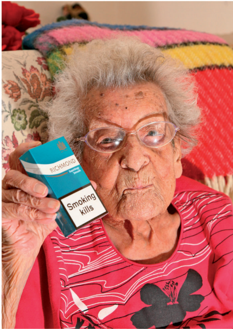
Figure 7 Winnie: the tail of a distribution or a 'black swan'?

population and variations over time or between populations—can be found in the writings of such disparate figures as R.A. Fisher, 152 Sewall Wright 153,154 and Richard Lewontin, 155 although with greatly varying emphasis. Epidemiologists and other population health scientists have drawn out the implications of this well-established and non-controversial insight in ways that link it with classical epidemiological reasoning (Box 5). 156–158